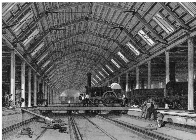
Swindon Engine House